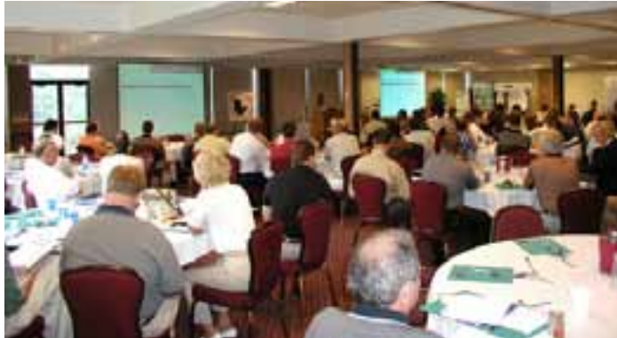
Providing educational and networking opportunities for the business community of Northeast Ohio, NEOTEC and ITAC host numerous seminars and conferences throughout the year. Examples include NEOTEC's annual Logistics Conference (pictured here), plus ITAC training events covering specialized export topics and regulations such as NAFTA, REACH and ITAR