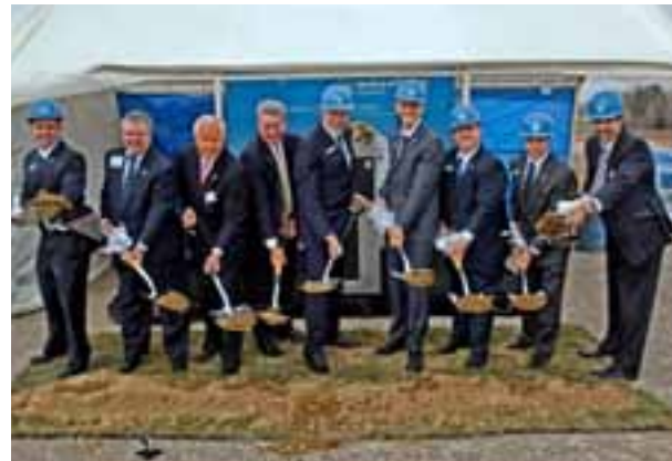
The fruition of a strong collaborative effort from a Northeast Ohio team of officials, economic development professionals, and area chambers was the March 2011 groundbreaking of a new manufacturing facility in Akron for Röchling Automotive USA. The new plant has brought more than a hundred new jobs and a payroll of $5 million to Northeast Ohio.

regional economic development partnership that works collaboratively in the region with the goal of attracting capital investment and jobs to Northeast Ohio through the administration of Foreign-Trade Zone 181, by providing international trade assistance to promote international commerce, through the development of a world-class logistics system, and through the attraction of foreign direct investment.