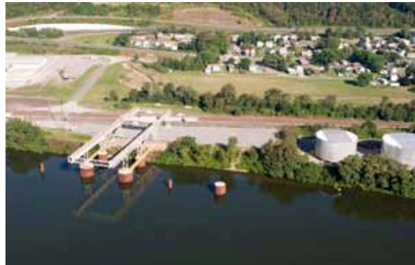
Part of Northeast Ohio's multimodal logistics system is the Intermodal Industrial Park along the Ohio River in Wellsville. This 70-acre facility is located at the northernmost tip of the Ohio River system in Foreign-Trade Zone 181, offering a dedicated highway interchange, a 3,500-foot rail siding and a 60-ton bridge crane that can load from barge to truck or rail car.

companies engage in international commerce, the FTZ program is increasingly more important and viable as a global supply chain management tool.